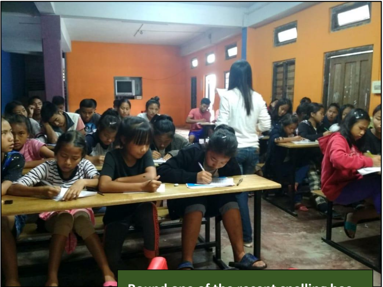
Round one of the recent spelling bee.