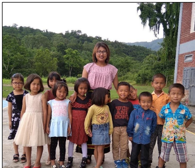
The children at Angels' Place look up to Sawmi with love and respect. After all of these years, the home can tell many success stories.