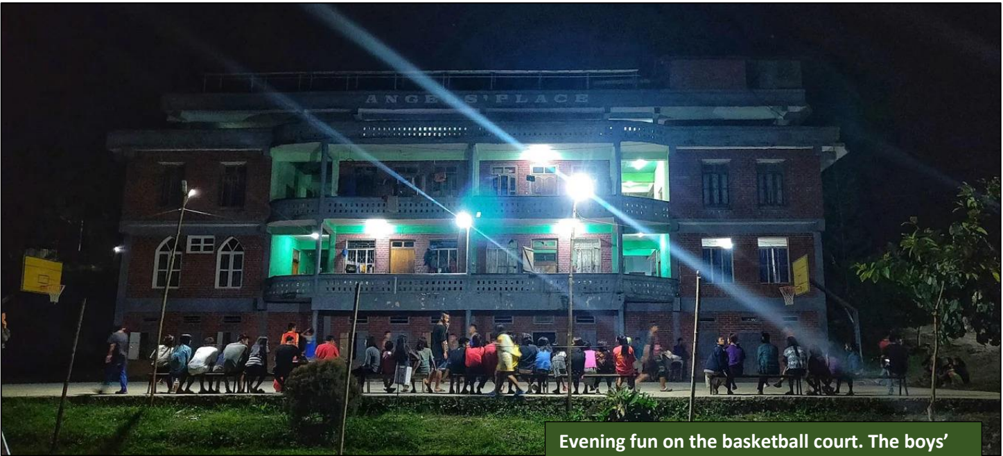
Evening fun on the basketball court. The boys’ dormitory is in the background.

Fortunately, throughout the years we have not had to expel more than a few children, but we recognize that when we do, it is disappointing to their sponsors. If that happens to you, please don’t hesitate to ask us about the departure of your child.