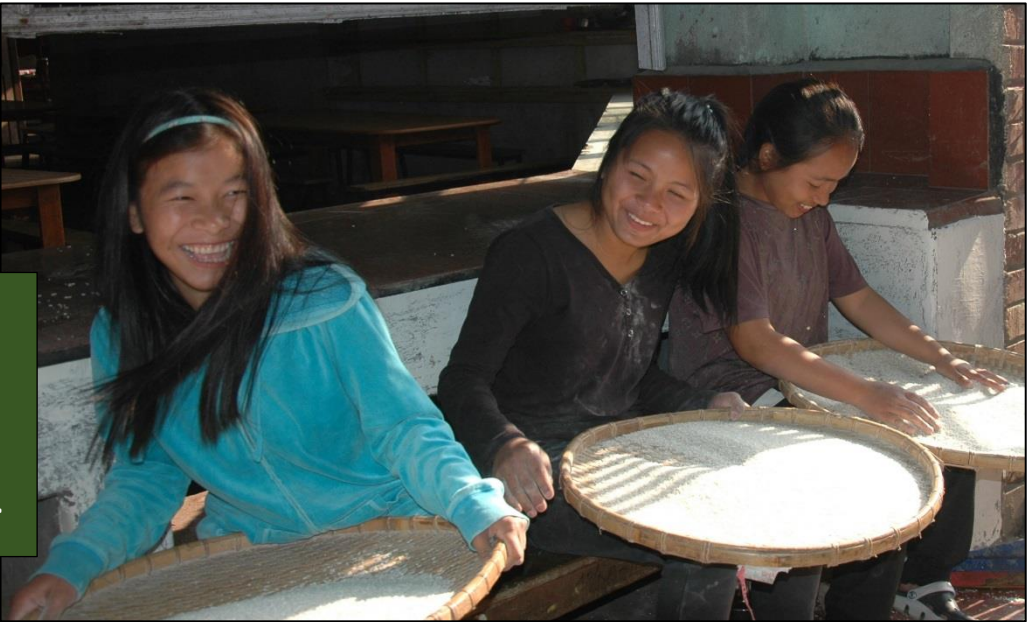
These girls work in the kitchen sifting rice to make sure there are no foreign items in it. They shake the basket and then inspect the rice to see if they should pick out any dark spots.